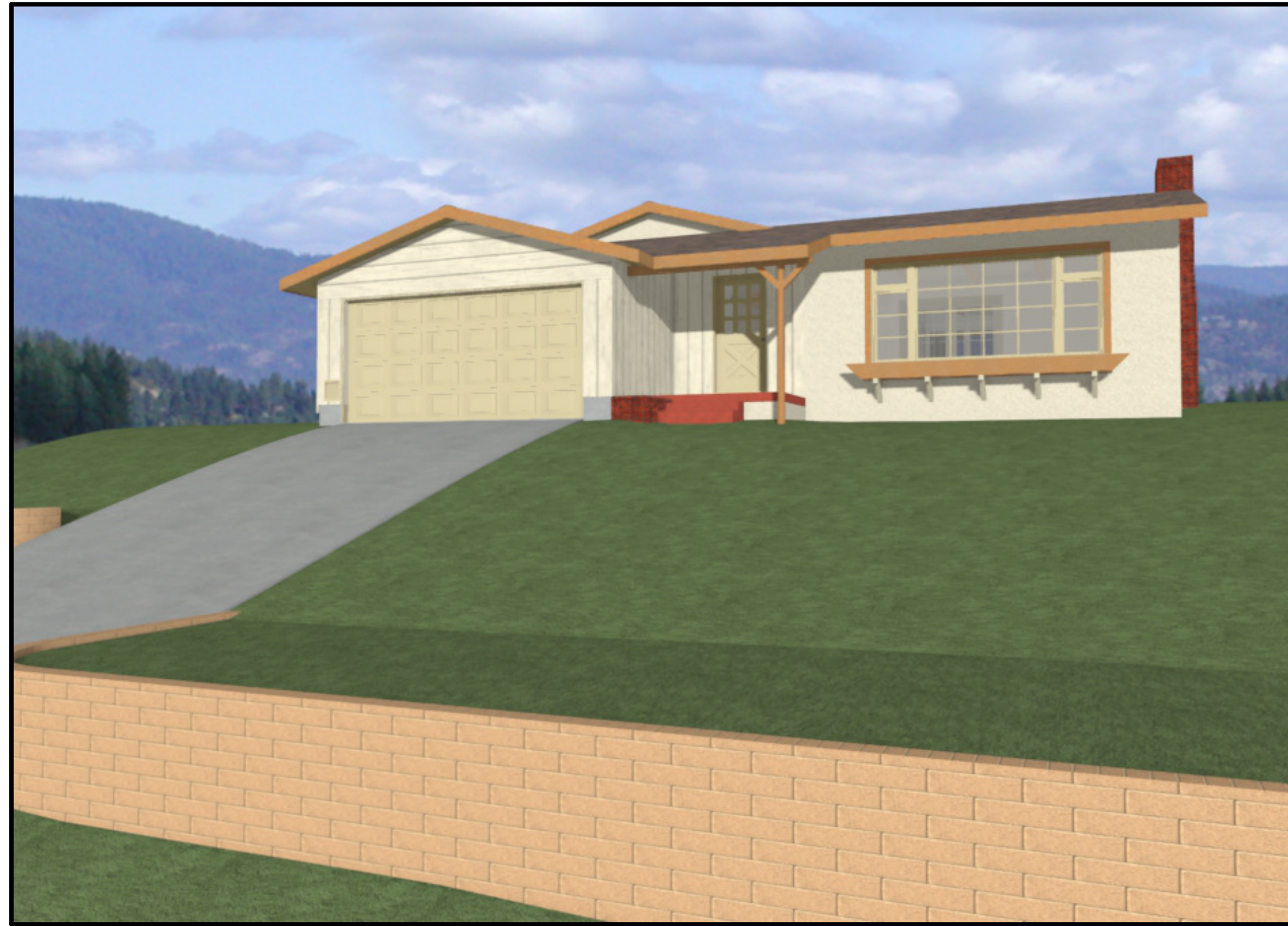
EXISTING FRONT VIEW 3-D RENDERING