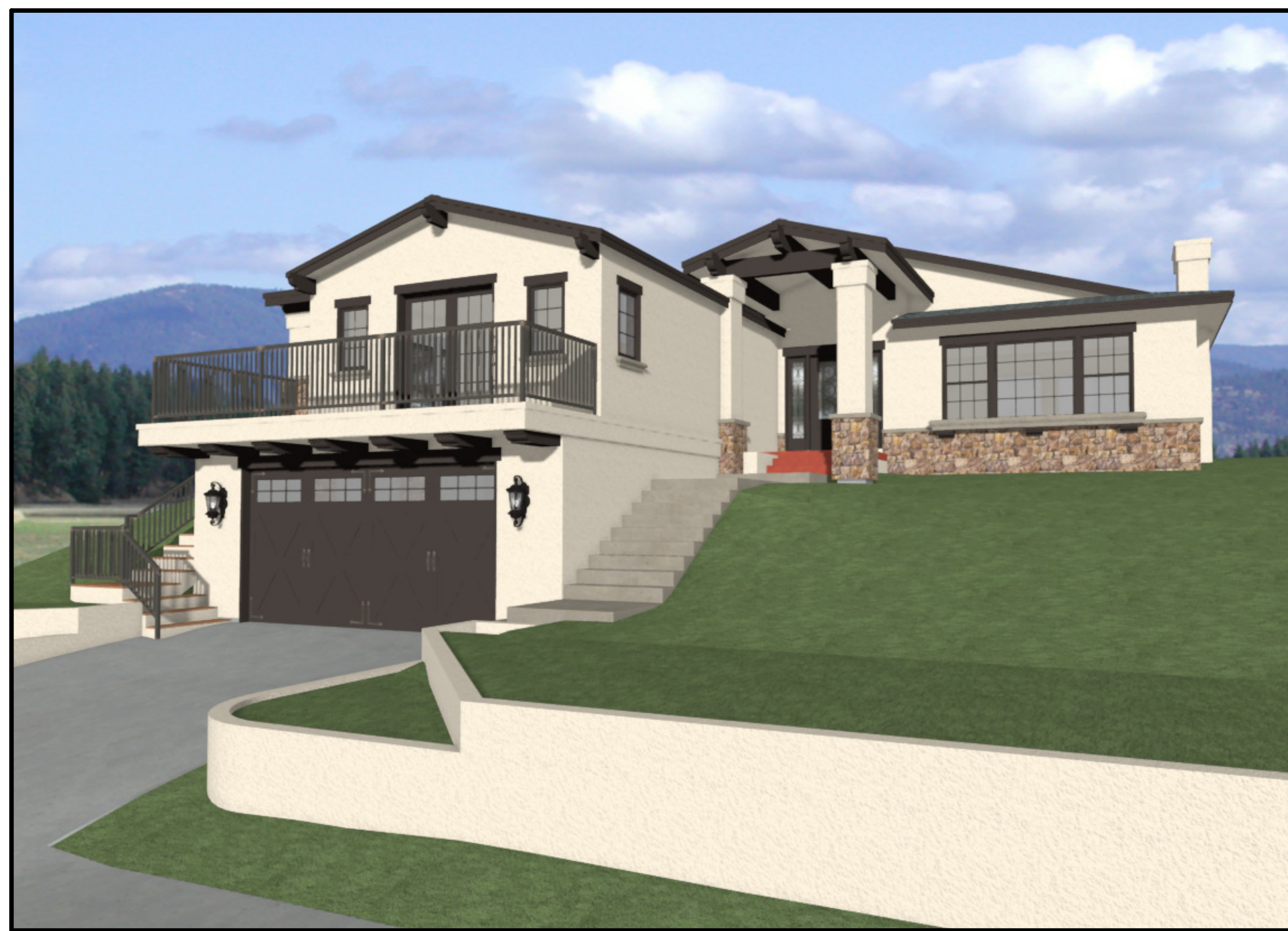
PROPOSED FRONT VIEW 3-D RENDERING