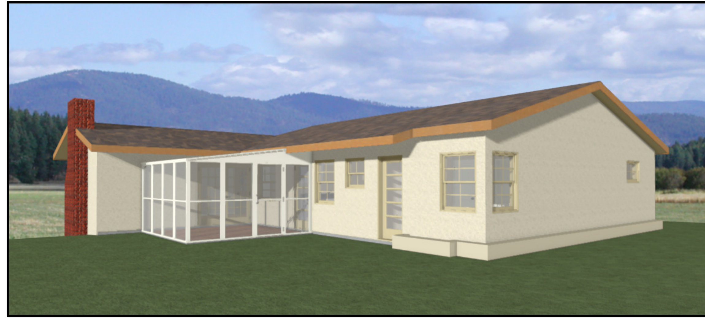
EXISTING REAR VIEW 3-D RENDERING