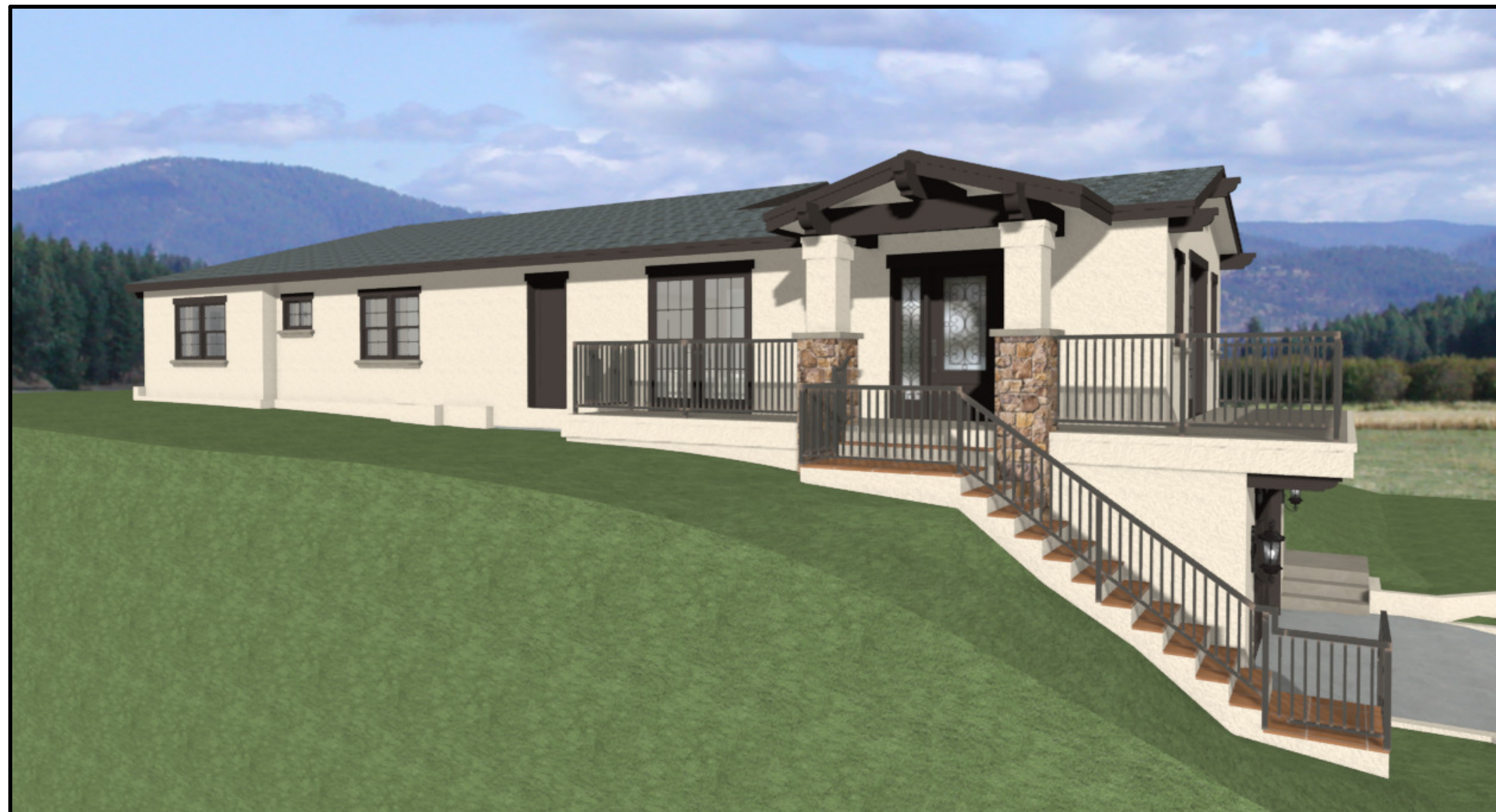
PROPOSED LEFT SIDE VIEW 3-D RENDERING