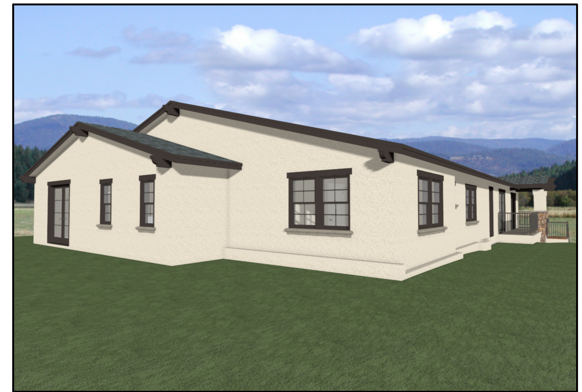
PROPOSED REAR VIEW 3-D RENDERING