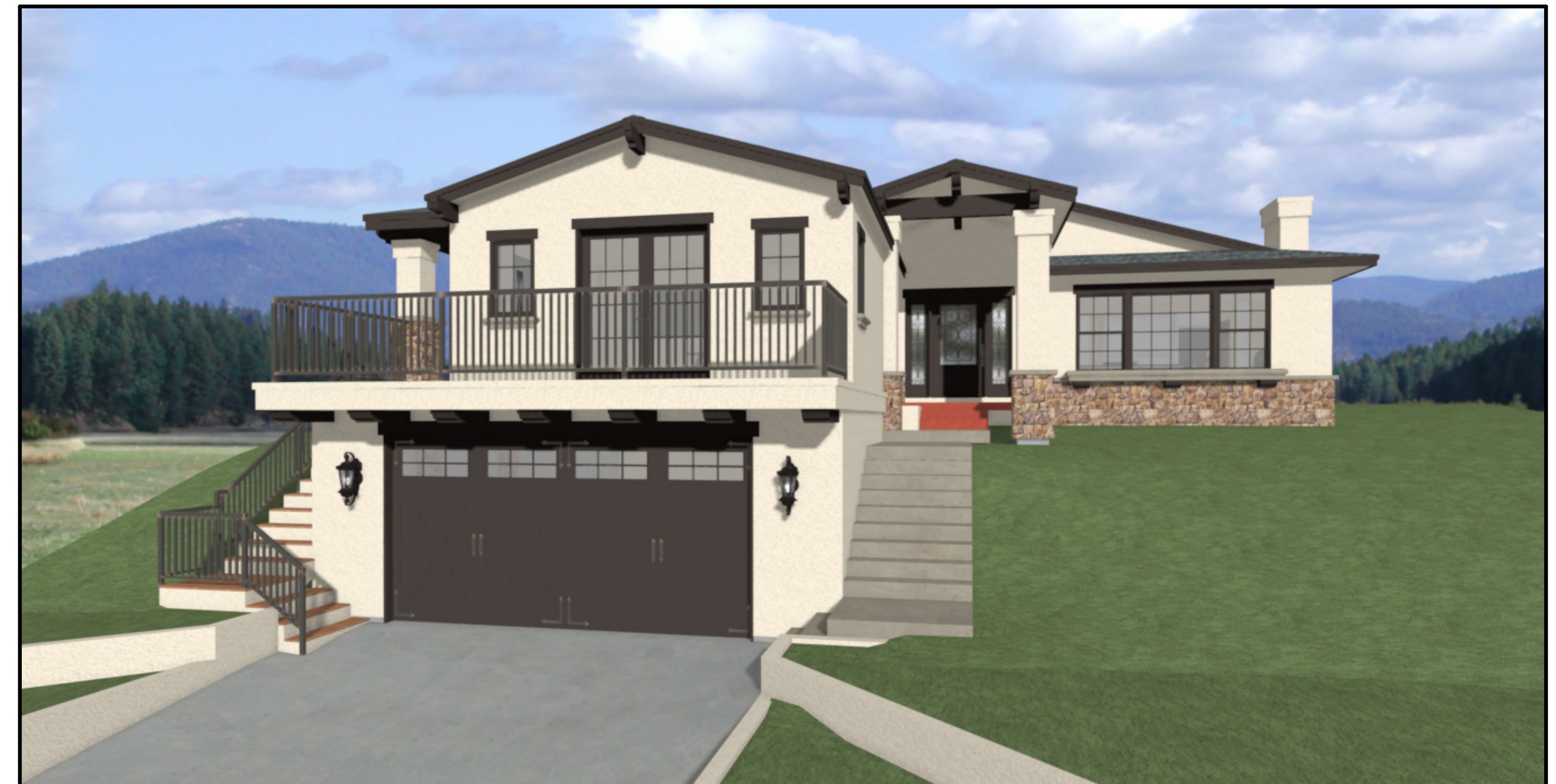
PROPOSED FRONT VIEW 3-D RENDERING