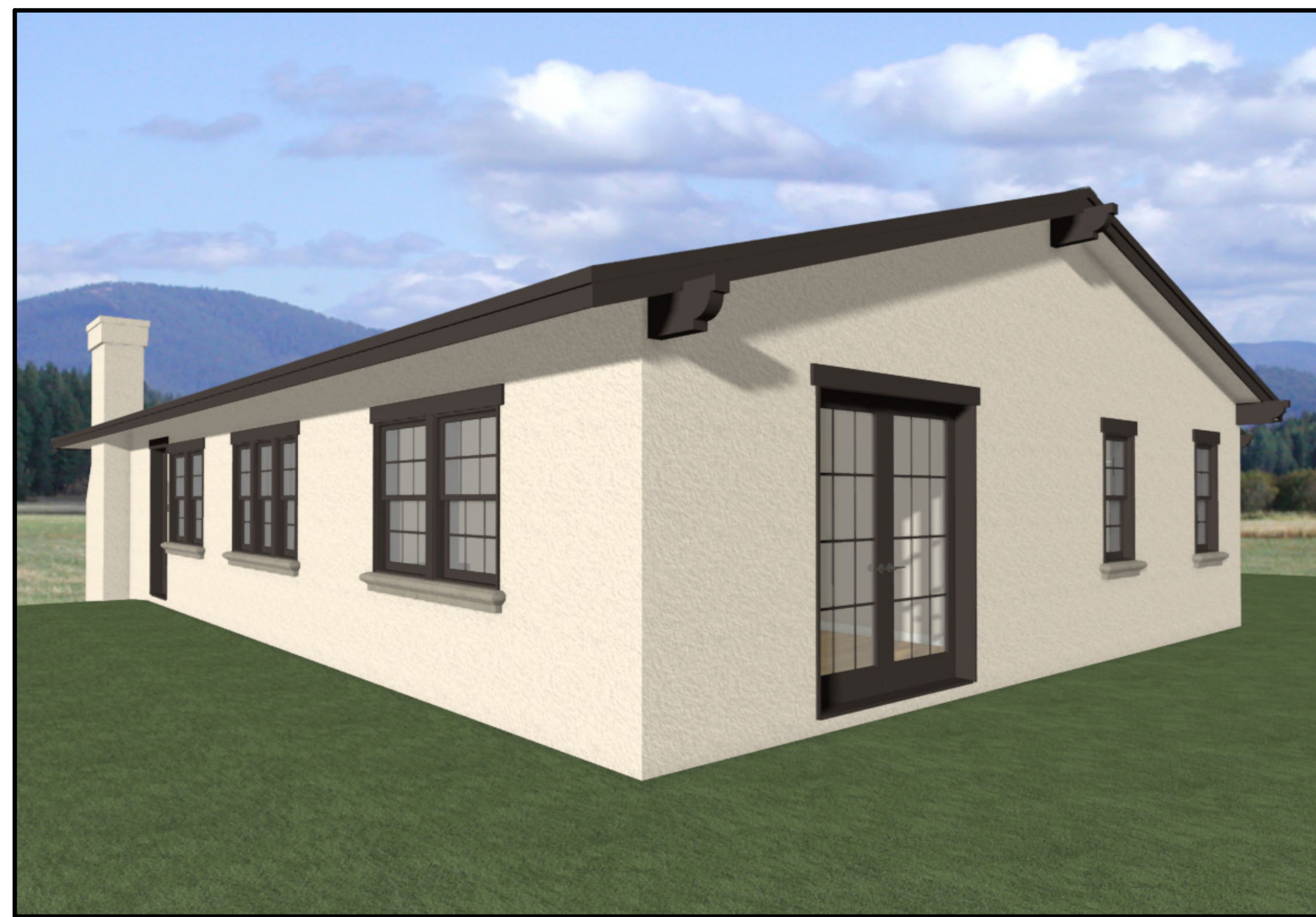
PROPOSED REAR VIEW 3-D RENDERING